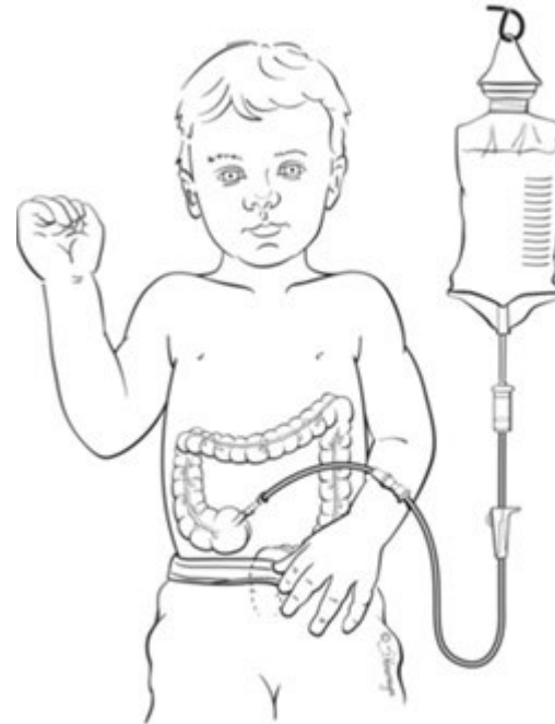
Picture 1 Getting an enema flush through the Malone.

https://www.nationwidechildrens.org/family-resources-education/health-wellness-and-safety-resources/helping-hands/appendicostomy